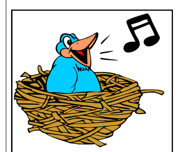
Chancel Choir Practice Wednesdays 7:00 p.m.